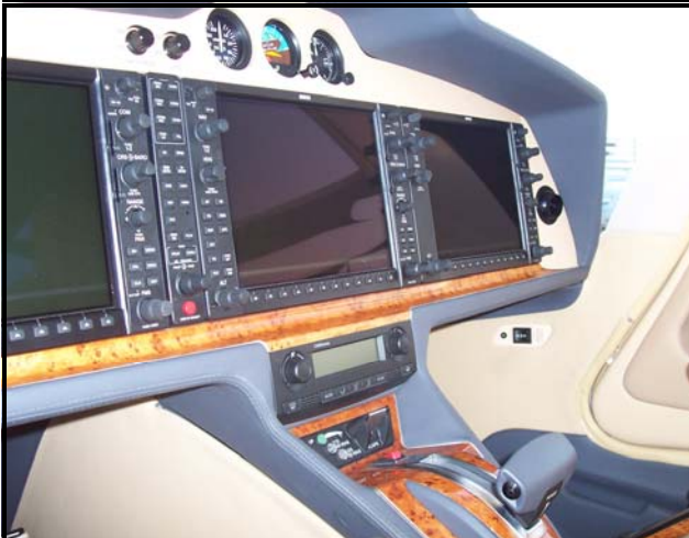
The Cockpit of the new Diamond DA-50. Looks like serious competition for Cirrus

MAY NEWSLETTER DEADLINE Please have articles in by May 25th Yakjim@aol.com or 261-3313