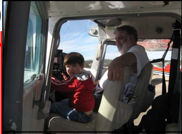
A Sunday Afternoon At Lakeway Airpark