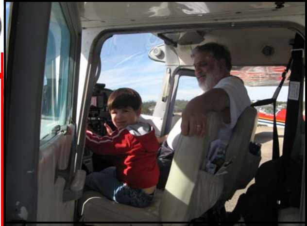
A Sunday Afternoon At Lakeway Airpark