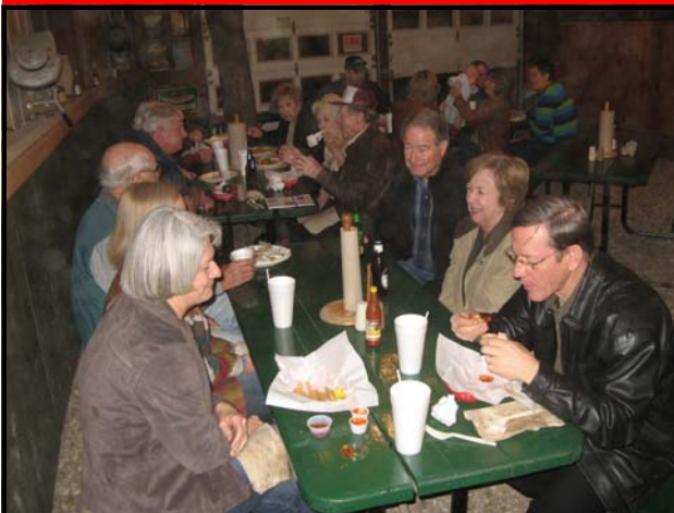
February dinner at Boat House Grill

Aviation Industry Expo March 18-20 Dallas Convention Center